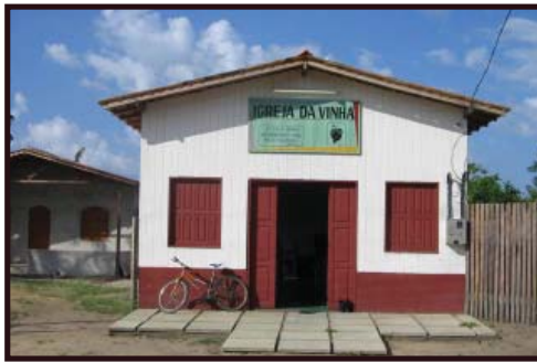
Build children school room at the Prião Church - $8,000.00