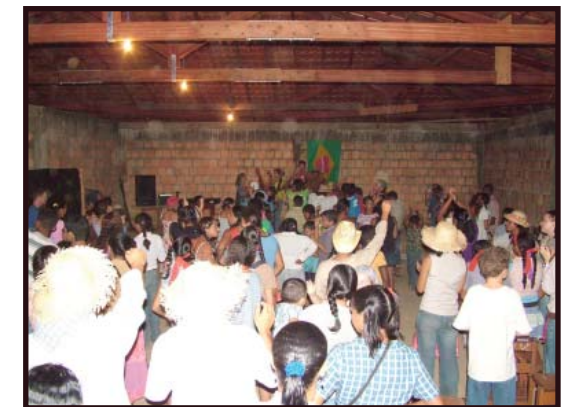
Lively worship to our Lord