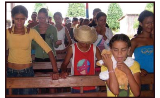
Worshipping the Lord