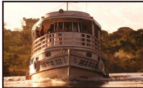
Rebuild Marantha III engine - $3,000.00